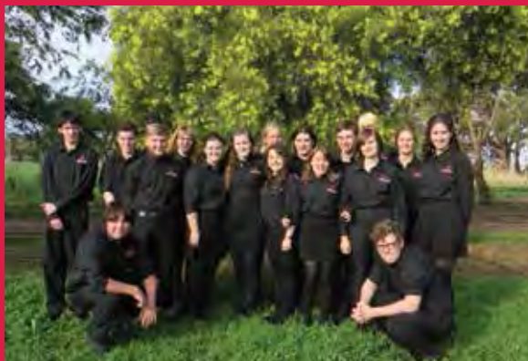
The Elizabeth College Stage Band ready for action